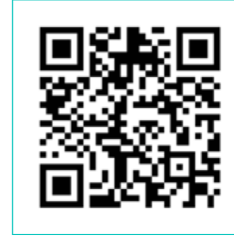
QR Code Facebook